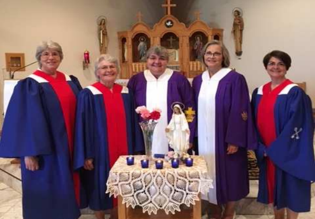
Court Saint Katharine Drexel installation of officers on Wed June 22, 2022 @ St Thomas, Roscoe.

Weekly Readings Sun Jun 26: Thirteenth Sunday in Ordinary Time 1 Kgs 19:16b, 19-21 Gal 5:1, 13-18 Lk 9:51-62 Mon Jun 27: St Cyril of Alexandria, Bishop & Doctor of the Church Am 2;6-10, 13-16 Mt 8:23-27 Tues Jun 28: St Irenaeus, Bishop & Martyr Am 3:1-8, 4:11-12 Mt 8:23-27 Wed Jun :Sts Peter & Paul, Apostles Acts 12:1-11 2 Tim 4:6-8, 17-18 Mt 16:13-19 Thurs Jun 30: The First Martyrs of the Holy Roman Church Am 7:10-17 Mt 9:1-8 Fri Jul 1: St Junipero Serra, Priest Am 8:4-6, 9-12 Mt 9:9-13 Sat Jul 2: Weekday Am 9:11-15 Mt 9:14-17